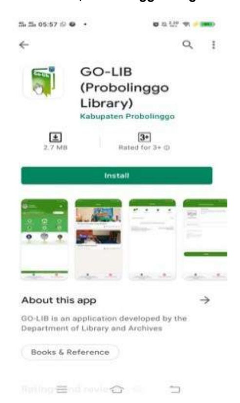
Figure 1: GO-LIB, Probolinggo's digital library

A high-level education official confirmed this innovative service by the district library and we checked that the application is listed in Google Play.